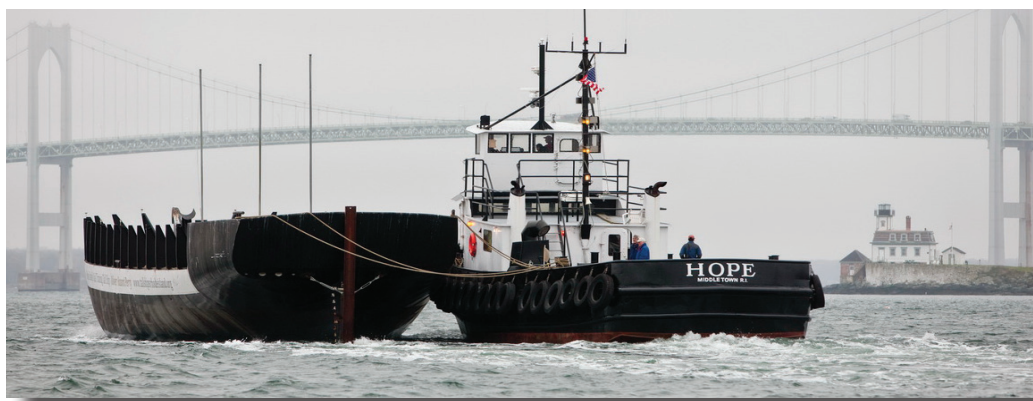
The hull of Rhode Island's future education at sea tall ship, SSV Oliver Hazard Perry , towed by Hope on its way to Providence for major construction work.

When not performing its education at sea objectives offshore (approximately 40 weeks per year), SSV Oliver Hazard Perry will be prominently displayed and available to the public in Newport, RI. Thus, SSV Oliver Hazard Perry will strengthen our tourism industry and add value to the visitor experience in Newport.