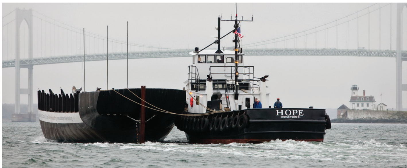
The hull of Rhode Island's future education at sea tall ship, SSV Oliver Hazard Perry , towed by Hope on its way to Providence for major construction work.