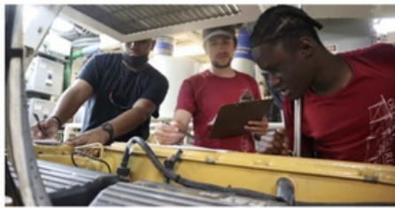
Perry Corp aboard Oliver Hazard Perry